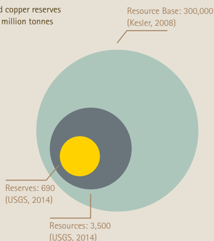
FIGURE 1: World copper reserves and resources in million tonnes (USGS, Kesler)

It is also important to note that copper is naturally present in the Earth's crust at a concentration of about 67 parts per million (ppm). Thus the total amount of copper in deposits above 3.3 km, a likely limit of future mining, is estimated at 300,000 million tonnes (Kesler, 2008).